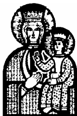
Our Lady of CZESTOCHOWA